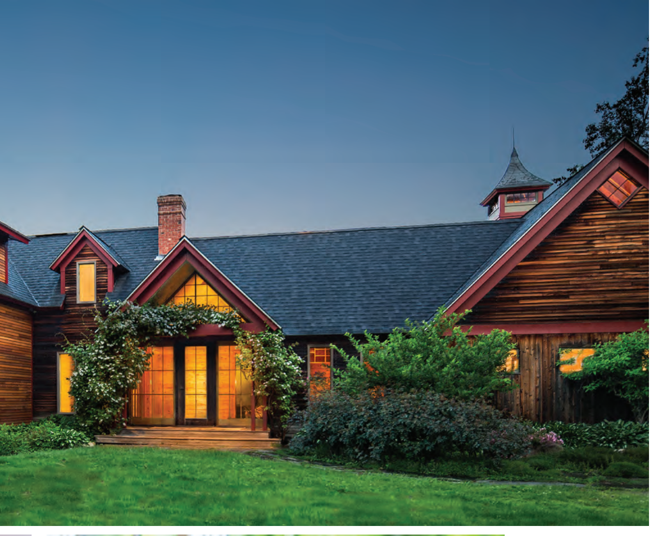
Clockwise: The exterior of the award-winning remodeled home in Fayston features resilient and beautiful Western red cedar clapboard and shiplap siding. A classic, functional style for any kitchen, a deep farmhouse-style sink was a must-have for the clients. Custom-milled heart pine flooring was installed throughout the newly remodeled open floor plan for the first floor.